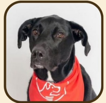
Cole Datsko Cole