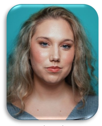
Brooke Echnat Wood Nymph Adaria