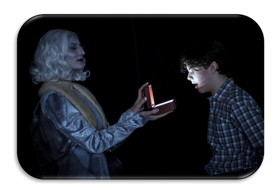
"What would you like best to eat?" "Turkish Delight, please, your Majesty," said Edmund.